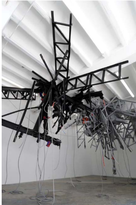
Mia Feuer, "Stress Cone", installation view, 2011.

Mia Feuer's sculptures don't care for your personal space. They take inspiration from the inner workings of the urban landscape and bring fractured outdoor structures into the gallery, usually at such a large scale that you'll have to duck. Her massive site-specific installation at Conner Contemporary Art, Stress Cone , on display through April 30, is no different. All steel beams and cables, it hangs intrusively from the ceiling of the gallery, mangled like the historical detritus of yesterday's industrial age. It says something about our urban lives -- increasingly digital, but reliant as ever on an aging industrial infrastructure. We caught up with Mia to ask her about it.